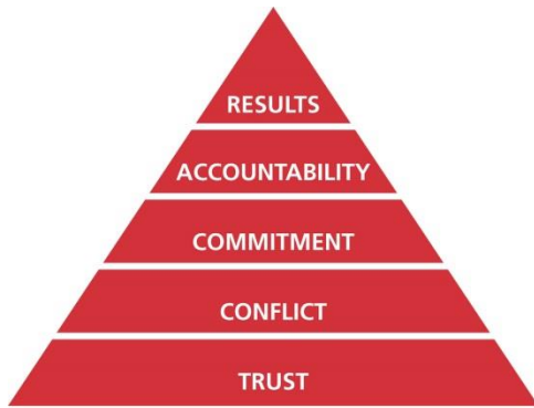
The Five Behaviors of a Cohesive Team™ Model